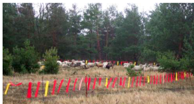
Figure 2 – Fladry as an acute measure after a wolf attack. The fladry was drawn around an electric sheep net that was jumped over before (Photo: I. Reinhardt).

as night corrals (Poland). In other countries their use is not recommended (Switzerland, Italy/Piemonte, Slovenia) or only in combination with livestock guarding dogs (France). In Spain a massive mesh wire fence 200 cm in height with barbed wire on top was tested in the frame of LIFE - COEX. This fence is dug an additional 50 cm into the ground and has proved to be 100% safe against wolves or stray dogs (LIFE - COEX C6, 2008). In Saxony non electric fences are recommended to be at least 120 cm, preferably 140 cm, in height with a protection against digging (defined minimum prevention standard, see above). In Germany this kind of fence is in general only used on small pastures in where people graze just a few sheep as hobby and on a permanent basis.