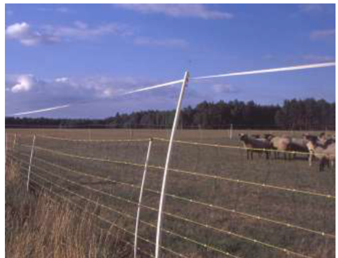
Figure 3 – White cord stretched 20–30cm over the electric net fence to keep wolves from jumping over.

Several projects clearly confirmed the effectiveness of LGDs. The LIFE - COEX project provided 245 LGDs mainly to shepherds in Portugal (92), Spain (75) and Italy (78). In Portugal the damages decreased in 72% of these farms and the overall reduction in damages averaged 27% (13–100%), with an average of 11.08 animals killed per flock per year before and 6.36 animals killed after adult LGDs were integrated. In Spain the number of attacks on flocks decreased by 61% per year after the dogs were introduced (2.4 attacks / holding / year before dogs, 0.9 attacks / holding / year after dogs), and the total number of animals killed decreased by 65% (15.1 / year / holding before dogs, 5.3 / year / holding after dogs) (LIFE - COEX 2008 - Report Action D2).